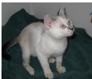
Pearl, Siamese mix

Pearl is a young cat who may be full grown. She's just a very petite girl. She's a Siamese/short-hair mix who loves to play. She is deaf, but this does not seem to be a problem for her. She must be an indoor cat (as all cats should be).