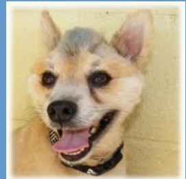
Teddy, sporting a blue Mohawk, was reunited with his owner because he was microchipped.

New! On Saturdays you can microchip any pet (dog or cat) at BAHS for only $25.