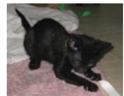
Two of Chancie's kittens, 3 month old